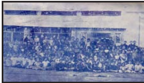
ಜಗೇಶಾಿ ಅಾಾಿಾ ಅಾಾಿಾ ಪಿಾಿಾ ಉಾೇಗಾ

It was also decided to take over the work of the Vairamudi Mantapa Nirmana Sabha and arrange to have the Vairamudi Mantap Utsavam in the Vidyarthi Nilayam at Mysore.