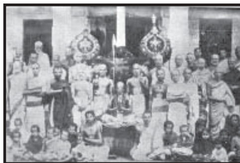
ಪಾಪಿಾಉೇಶಾಿ ಅಾಾಿಾ ಉೇಶಾಿಪಿಾಿಾ ಪಾಪಿಾಉೇಶಾಿ

This most important beneficiary gain of the above mentioned activities of the Sabha, during 1915-1935 - a period of 20 years, is the establishment of the Mandayam Students' Home at Rama Vilasa Agrahara in Mysore, constructed at a cost of Rs. 5,525 raised as a debenture loan. Many generous hearted Mandayams contributed money to this building.