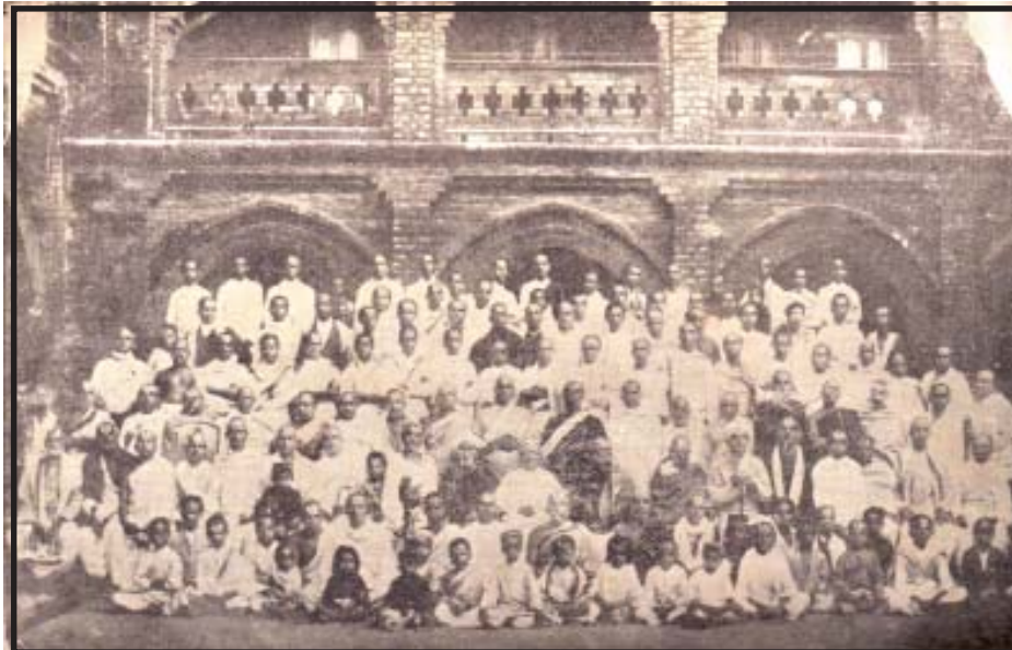
ᱪᱟᱹᱨᱤᱞ ᱦᱚᱱᱚᱛ ᱦᱚᱱᱚᱛ ᱦᱚᱱᱚᱛ ᱦᱚᱱᱚᱛ