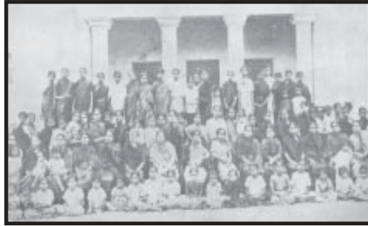
ಅಜರೇಶಾಿ ಅಾಾಿಾ ಅಾಾಿಾ ಪಿಾಿಾ ಅಾಾಿಾ