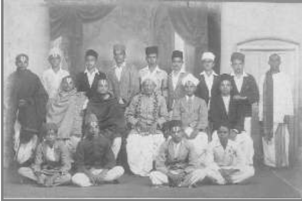
The Sixty Years of The Mandayam Vidyarthi Nilayam, Mysore

We bring you excerpts about the Vidyarthi Nilayam as recorded in various reports available in our archives.