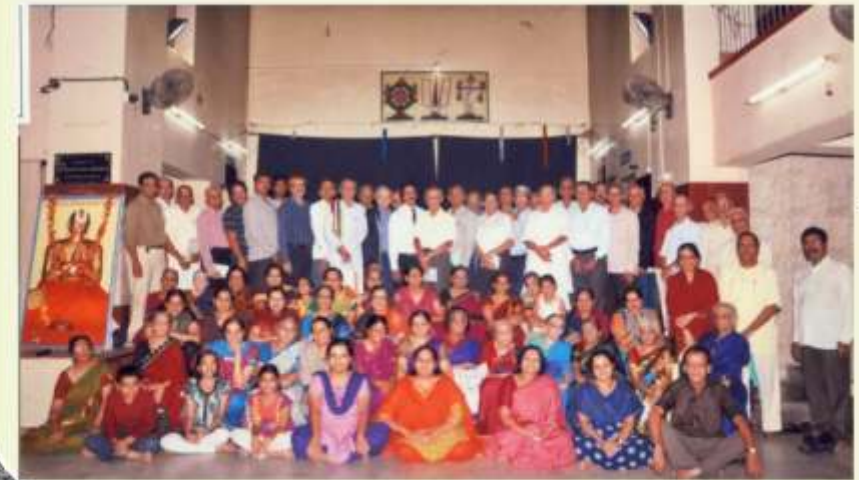
Group photo of volunteers who were instrumental in successful conduct of Seminar on Mandayam Achievers and Andal Vaibhavam programmes of the Sabha.