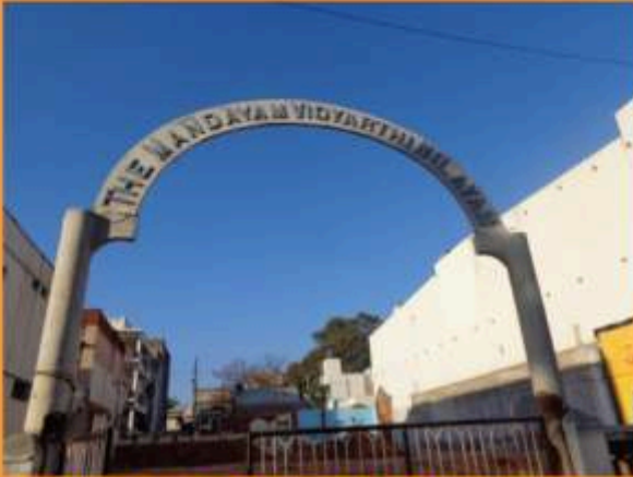
The latest picture of the progress of Reconstruction of Mandayam Vidyarthi Nilayam, Mysore