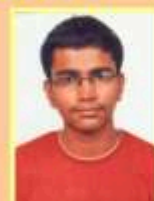
M.C. YESHASH PUC - 92.6%