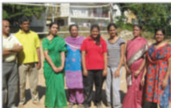
The Runners-up Throwball Team