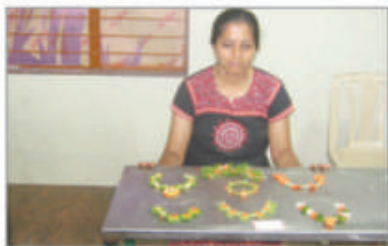
Jewellery with Vegetables