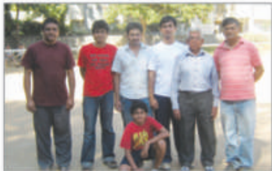
The Winning Volleyball Team

The run up to the annual Mandayam meet in December began on a sober note on the 21st of November 2011 at the Chamundi Scout grounds, Malleswaram with Volleyball for men and Throw ball for women. It was a low-key event with a disappointingly small crowd. However, those who turned up made an enthusiastic beginning.