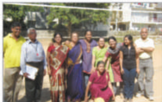
The Winning Throwball Team