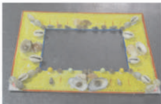
Jewellery with Vegetables