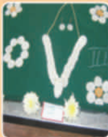
Jewellery Design using Vegetables