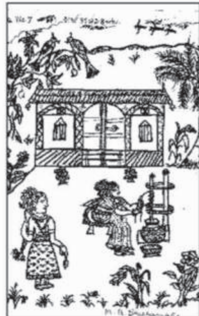
ಕಿಲೆ ಕಿಲೆ ಎನ್ನಂಗುಂ