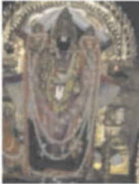
ಆಕಾಶಾತ್ ಪತಿಸಂತೋಷಯಂ ಯಥಾಗಚ್ಛತಿ ಸಾಗರಃ | ಸರ್ವದೇವ ನಮಸ್ಕಾರ ಕೇಶವಮ್ ಪ್ರತಿಗಚ್ಛತಿ ||