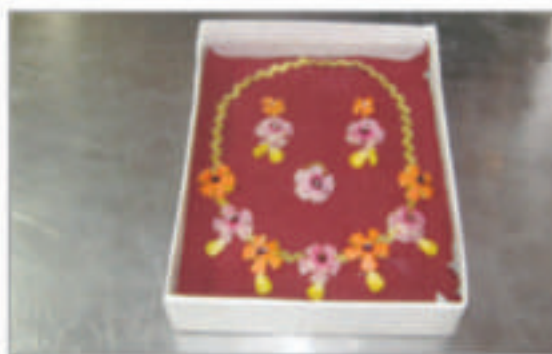
Jewellery with Vegetables