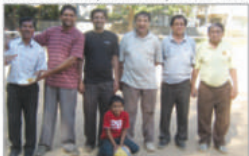
The Runners-up Volleyball Team