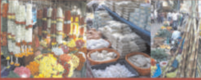
A happy Makara Sankranti