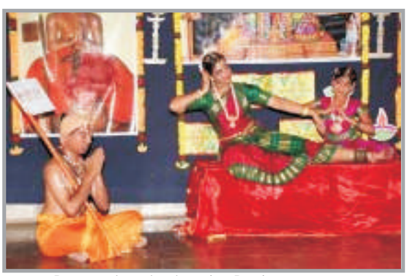
Ramanujar viewing the Dashavataram