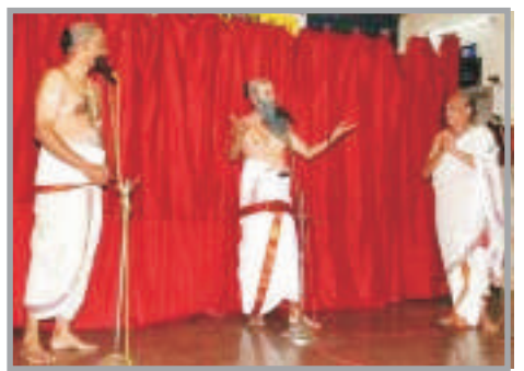
Yadavaprakasha conspiring with his shishyas