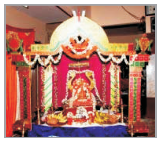
The Well decorated Mantapam

performed Aarathi. The Goshti entered the hall and the idols were placed in a well decorated Mantapam.