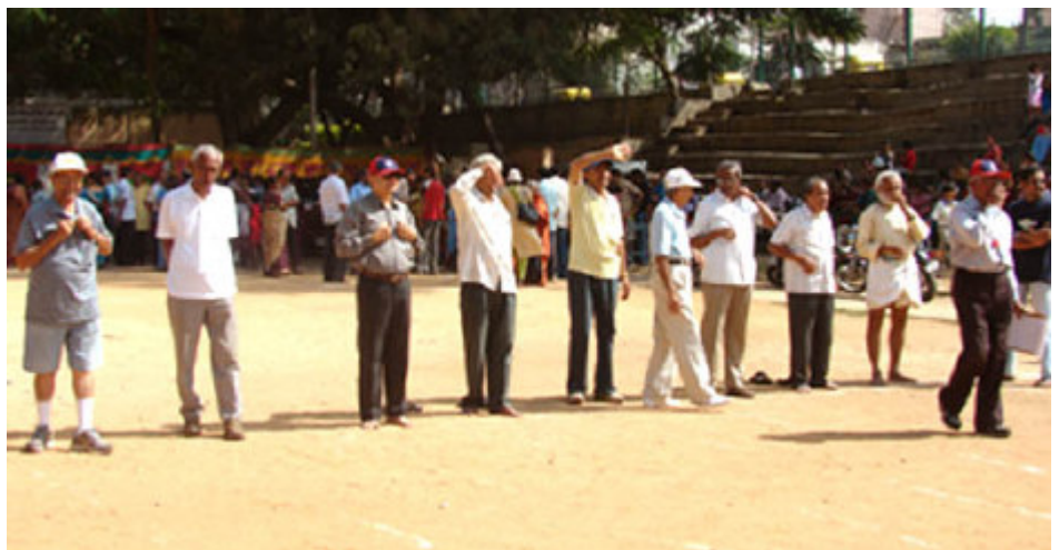
Men getting set to go at the race