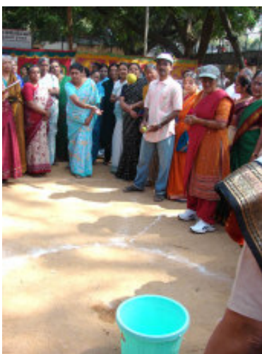
Throwing the ball in the bucket