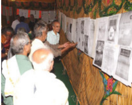
Visitors watching the display at the exhibition

The Exhibition – was thematic in nature, depicting the various aspects of our community. Items included the history of The Mandayam Srivaishnava Sabha, and its office bearers over the years. Brief bio-data with photographs of religious scholars, posters of sports and academic achievers were displayed. Posters of authors and their books were also displayed.