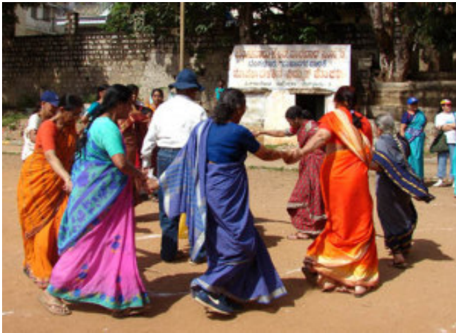
Women at the game