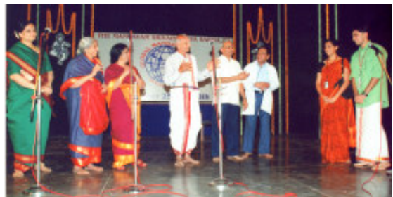
Tamil Short Play - "Ideal Kutumbam"