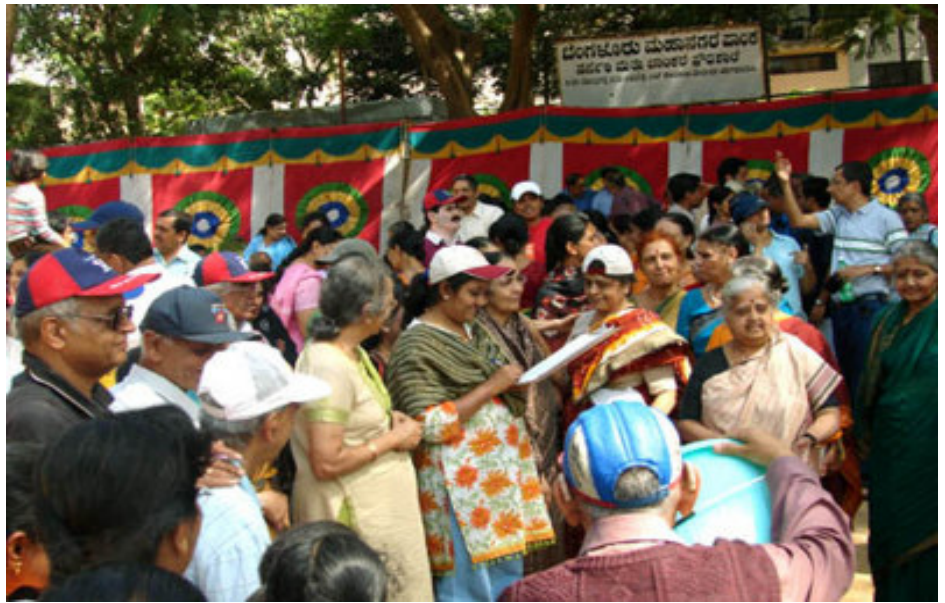
Enthusiastic participants and onlookers at the field events

On all Saturdays indoor competitions like drawing & painting, pot painting, craft with ice cream sticks, rangoli, cooking and vegetable carving