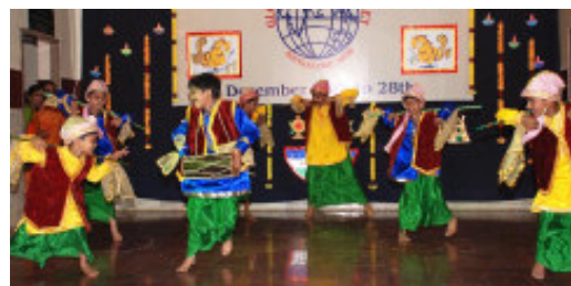
Young boys performing Bhangra Dance

Punjabi dance – a typical Bhangra by young boys aged 5 to 10 years; group dance by ladies with lighted lamps depicting “Anandam” – one of the Navarasas. In all about 36 artists took part in this evening’s cultural programme, which was short and sweet and thoroughly enjoyable, keeping the audience spellbound.