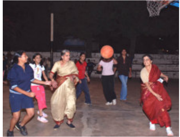
Women participating in basketball match