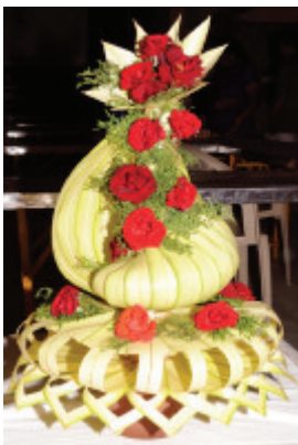
Indonesian Janur art decoration made of tender coconut leaves

Arts & Crafts Mela was a grand event put up by our enthusiastic Mandayams, mostly women, displaying various products made and being marketed by them. We had participants from Mysore, Chennai, Melkote. Various art and craft items produced by the members of our community were put up for display and sale at the Mela.