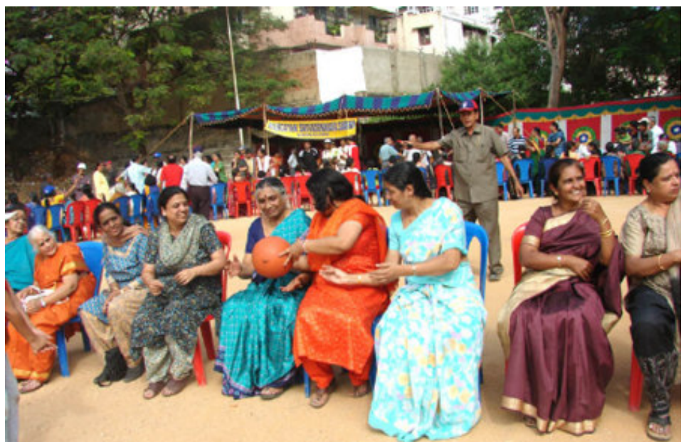
Women playing Passing the Ball

Copies of the GENEALOGY BOOK are available in Sabha Office. The original price is Rs. 250/-, but is being offered at Rs. 200/- for a limited period.