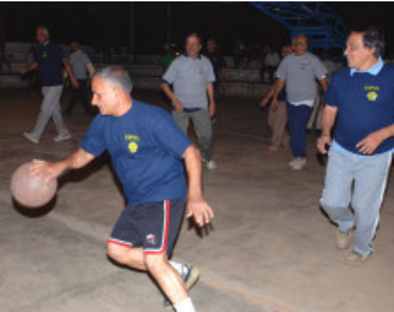
Men's basketball match in progress

The meet created a platform to recollect memories of the three popular basketball organizations we had, namely YMMA - The Young Men's Mandayam Association, YWMA - The Young Women's Mandayam Association, and BSU - The Bharath Sports Union. These were the teams in which majority of players hailed from our community and made their contributions to the game of Basket-Ball. Apart from the members of our community, many leading players of yester years of these organizations were also invited on this nostalgic occasion. The vision of the organizers and the task of bringing together all Basket-ball stars of yester years of YMMA, YWMA and BSU is highly commendable indeed.