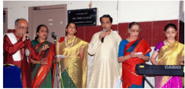
The group presenting the theme song

The Mandayam community which was largely confined to parts of old Mysore state has today spread all over the world and has contributed richly in various walks of life.