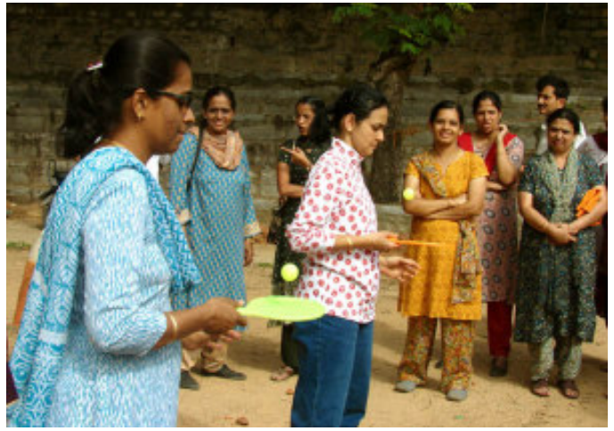
Girls balancing Ping Pong Ball

were conducted at the Sri Yadugiri Yathiraja Mutt premises. On all Sundays games like cricket, volley ball, throw ball and basket ball were conducted at various courts. A special mention must be made of basket ball, which was conducted this time at the Jayanagar stadium. In spite of the distance from Malleswaram – where many of the basketball players reside – the response was very good and encouraging. Another special feature of this year's sports was the inclusion of shuttle badminton, 'Pagadai' and carom, which attracted large participation.