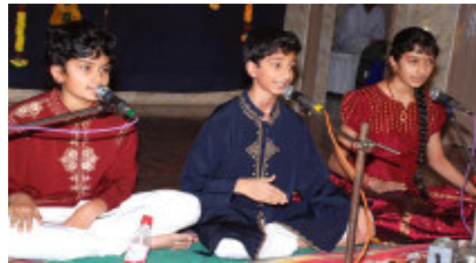
Young artists from Boston (USA) singing