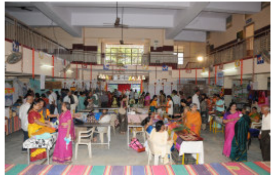
Another view of the Arts & Crafts Mela

The items displayed ranged from collection of rare items, to paintings, illustrations, embroidery, jewellery, hand bags, decorative items and delicately crafted items.