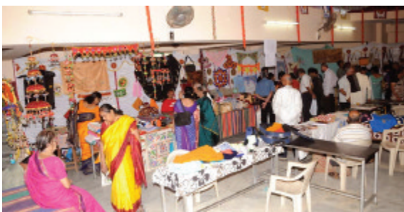
Various items on display at the Arts & Crafts Mela

Arts & Crafts Mela was a grand event put up by our enthusiastic Mandayams, mostly women, displaying various products made and being marketed by them. We had participants from Mysore, Chennai, Melkote. Various art and craft items produced by the members of our community were put up for display and sale at the Mela.