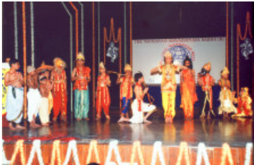
A still from the tableau "Sarva Dharman Parityajya"