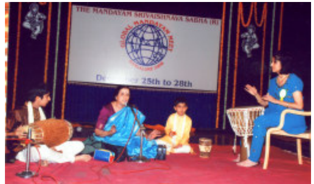
Sampalli family performing