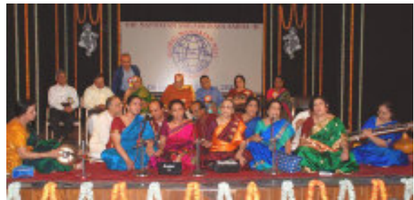
The Group presenting the Theme Song