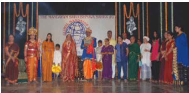
A scene from the "Mysore Heritage"