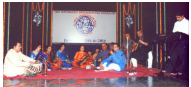
Kannada Folk Songs by Manikarnike Family