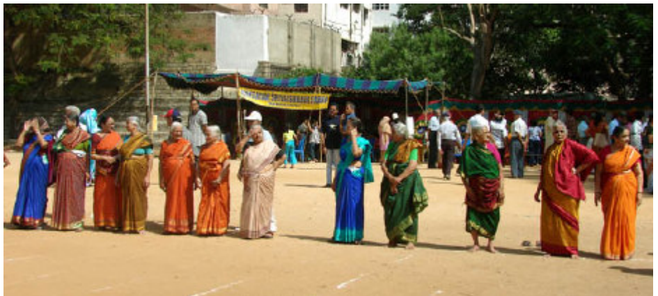
Women getting set to go at the race