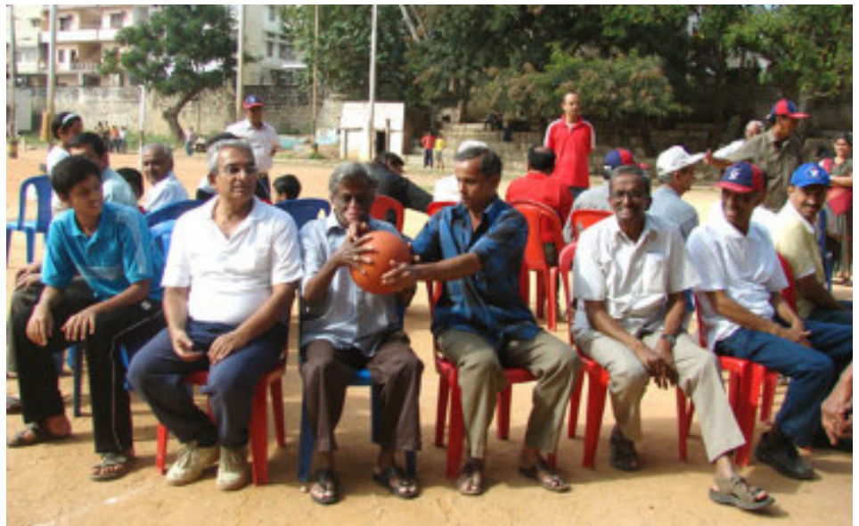
Men playing passing the Ball

were conducted at the Sri Yadugiri Yathiraja Mutt premises. On all Sundays games like cricket, volley ball, throw ball and basket ball were conducted at various courts. A special mention must be made of basket ball, which was conducted this time at the Jayanagar stadium. In spite of the distance from Malleswaram – where many of the basketball players reside – the response was very good and encouraging. Another special feature of this year's sports was the inclusion of shuttle badminton, 'Pagadai' and carom, which attracted large participation.