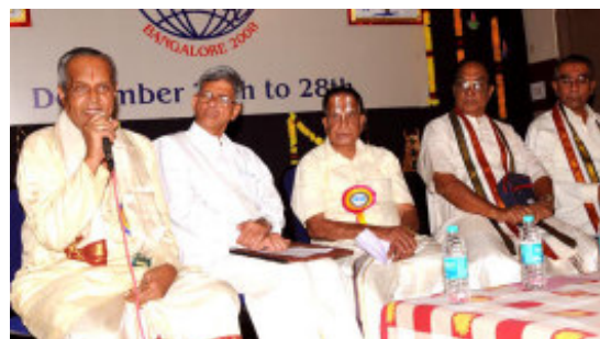
The Office bearers responding to the feedback & suggestions given by the participants

There was a feedback session and many members expressed their appreciation of the event, while many also offered useful suggestions. The Office bearers of the Mandayam Srivaishnava Sabha / Global Meet responded to the suggestions / queries.