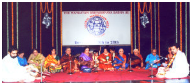
"Raaga Ranjitha" troupe performing