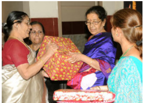
The lucky winner receiving the prize in Raffle

hailing "Vaalga Mandayam, Global Mandayam . . . needoodi Vaalga Mandayam, Global Mandayam".