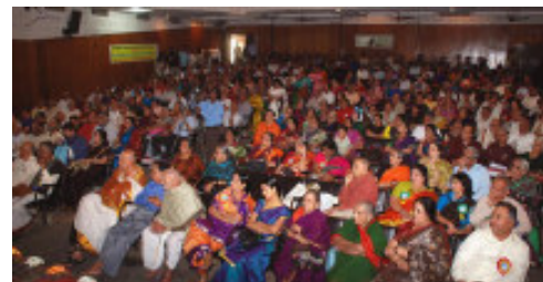
View of the audience in the hall