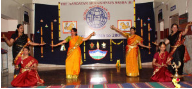
Women performing group dance with lamps