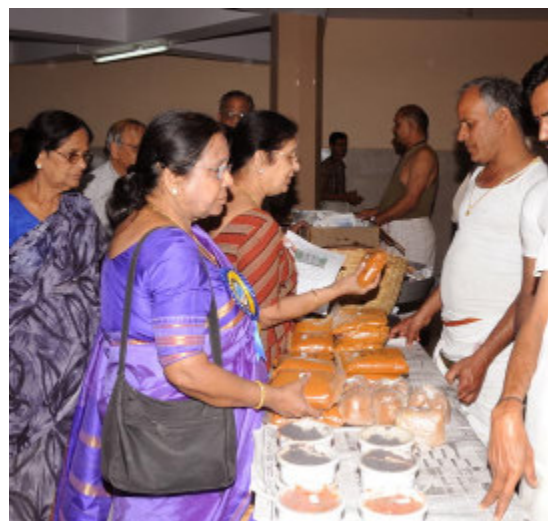
Visitors lining up to buy the specialties at the Mela

The mela was open to all and attracted a large number of visitors. How popular the mela was, could be known by the fact that, in the short period it was on, it generated a sale of more than a lakh of rupees.