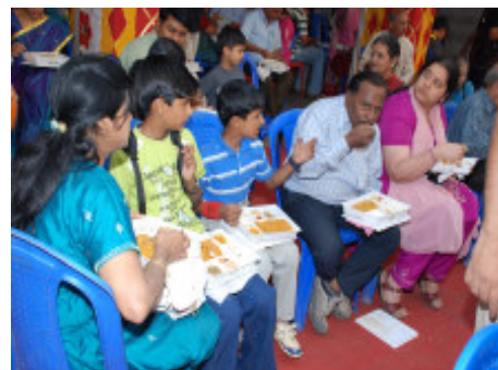
Participants enjoying the excellent fare served

There was a break for lunch. Considering the fact that there was no facility of a kitchen or a pantry at the venue and every thing had to be brought from outside to cater to nearly 700 participants, the arrangements made were excellent indeed.