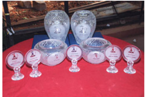
Crystal glass trophies for Golf Tournament