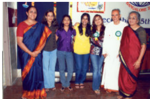
A scene from “Paatiyo ... Partiyo”

Punjabi dance – a typical Bhangra by young boys aged 5 to 10 years; group dance by ladies with lighted lamps depicting “Anandam” – one of the Navarasas. In all about 36 artists took part in this evening’s cultural programme, which was short and sweet and thoroughly enjoyable, keeping the audience spellbound.