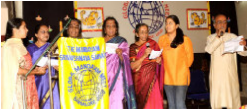
The group singing an anthem to the Global Meet