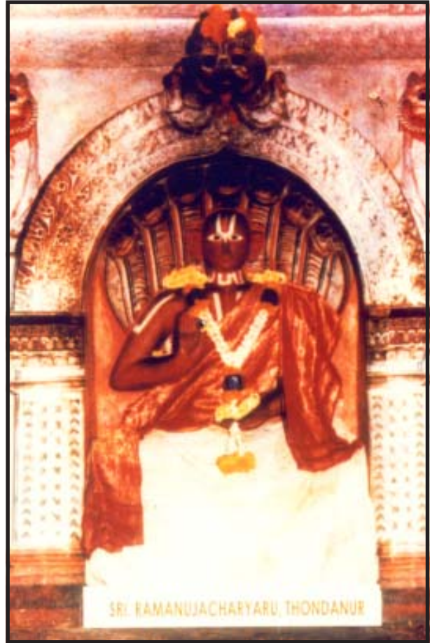
Sri Ramanujacharya at Thondanur

Thondanur, a small town, about 130/140 km from Bengaluru or about 40/45 km from Mysore, enjoyed a glorious heritage during the reign of King Bitti Devaraya. The king's palace lay just behind the temple and it is said that the king worshipped Sri Nambi Narayana daily with great devotion. The king's daughter was having some health problems. The worried king tried his best to get her cured with the help of physicians. When they failed to show any result, he sought the help of Jain Monks, who failed. The king, a staunch Jain, became desperate.