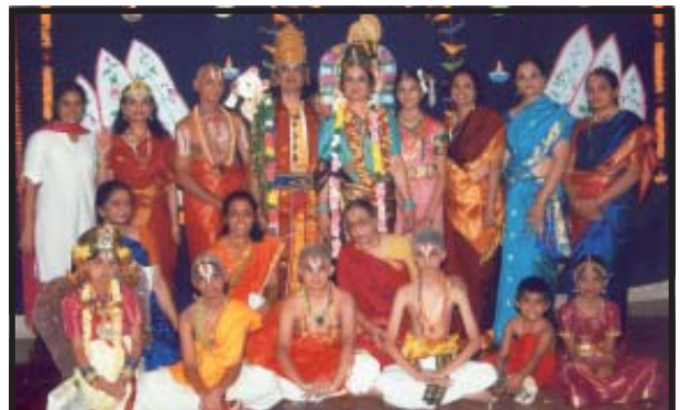
The Drama Troupe