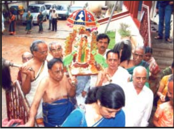
Sri Andal being brought in a procession to Sri Ramanuja Samskruthi Bhavana.

The festival was celebrated on Friday, the 25th July 2008 at Sri Ramanuja Samskriti Bhavana, Malleswaram.