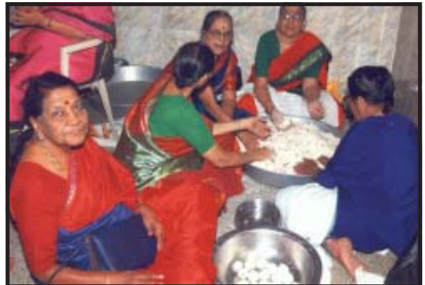
Volunteers preparing Pacchamaavu during the programme.

Lord Ranganatha : Mandayam Anandampillai