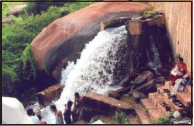
Water Falls (Old)

Narasimha temple is built on a small hillock. One has to climb about 20/25 simple steps to reach the temple. This temple has been recently renovated. The highlight of this temple is an unusual idol of Sri Ramanuja, who is in His ADISHESHAVATHARA. A beautiful idol, which incites curiosity and urge to find out 'why Sri Ramanuja appears thus'. It is said that Sri Ramanujacharya addressed a gathering of 1000 sarmans (jain pundits) and answered all their questions simultaneously by taking the form of Adishesha from behind a curtain. The amazed pundits were awe struck by his versatility. This is the Avathar found in the temple.