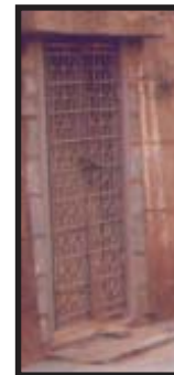
Rani Dwara to Temple