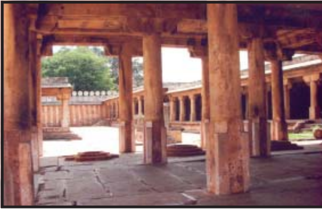
Inside Sri Parthasarathy Temple