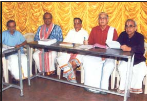
Members of Managing Committee of the Sabha receiving the Guests