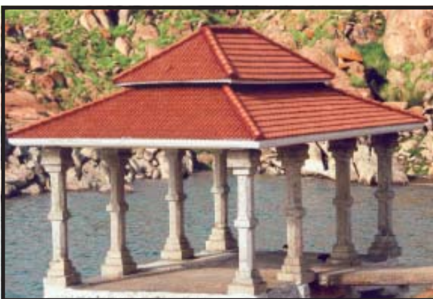
Mandapam at the Lake