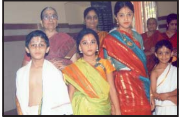
Our members at Sri Yathiraja Mutt