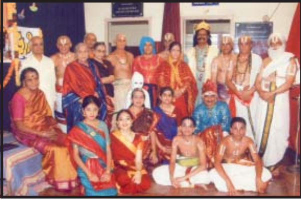
Participants of the skit "Sri Ramanuja Vaibhavam"