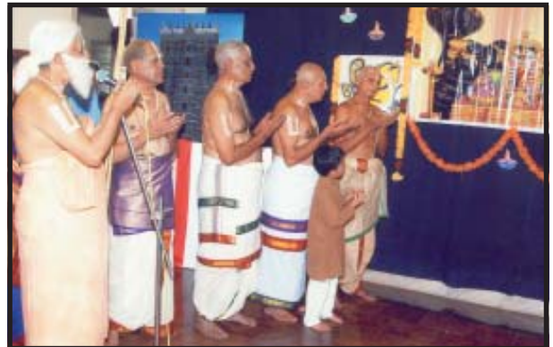
A scene from the skit "Acharya Vaibhavam".

Chairperson, Sports & Cultural Committee