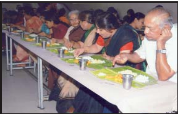
A section of Members having Lunch