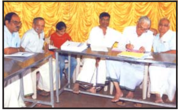
A few of the Management Committee members in action at the Reception area.