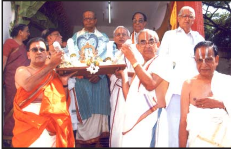
Our Members carrying Procession of Sri Ramanuja ceremoniously during Sri Ramanuja Thirunakshattiram -2008 (Details on pg. 3)