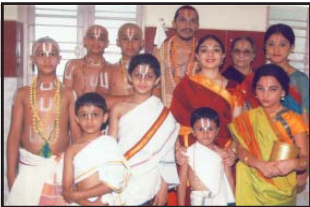
Participants in the skit by children.